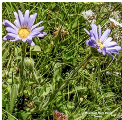
Flowering plants.