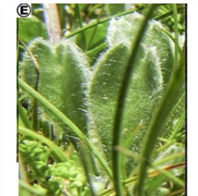
Leaves.