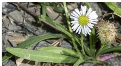
Flower head, spent flower, and leaf. Murray Sunset National Park, Vic