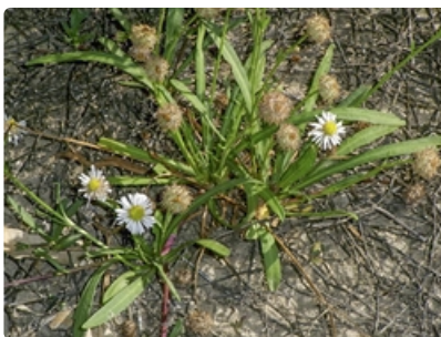
Plants. Murray Sunset National Park, Vic