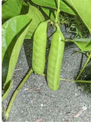
Young pods.