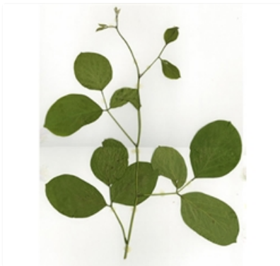
Stem and leaves. Australian Plant Image Index, Australian Tropical Rainforest Key, unknown photographer, unknown place