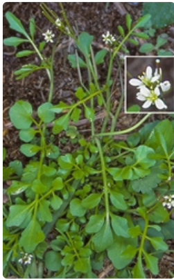
Flowering plant. Batehaven, south of Batemans Bay