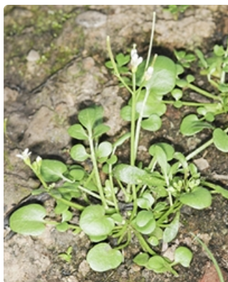
Plant.