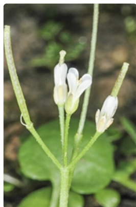
Flowers and leaf.