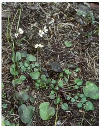
Flowering plant. Coolumboka Nature Reserve near Bombala