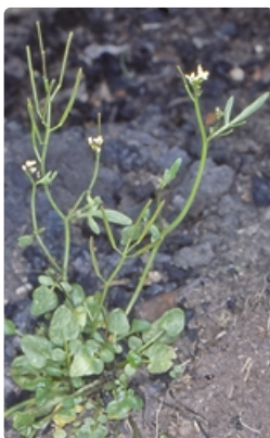
Flowering plant. Namadji National Park, ACT