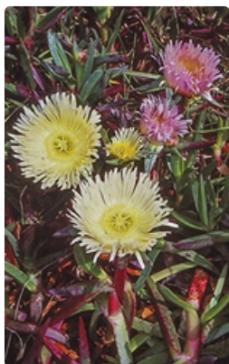
Flowers and leaves. Photographer Don Wood, Mystery Bay