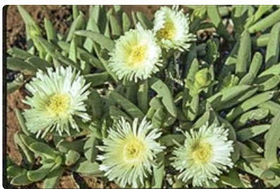
Flowers and leaves.