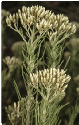
Flowering stems. Australian Plant Image Index, photographer Murray Fagg, Black Mountain, Canberra