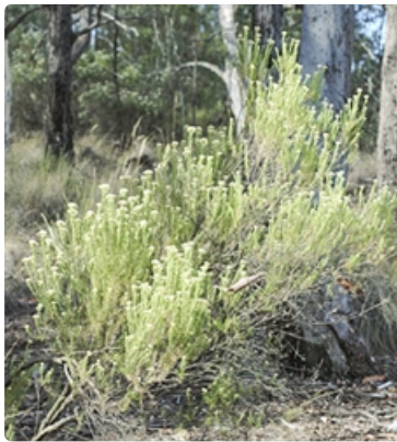
Shrub. Black Mountain, Canberra, ACT