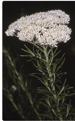
Flowering stem. Photographer Don Wood, Mogo State Forest near Mogo