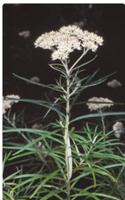
Flowering stem. Photographer Don Wood, Black Mountain, Canberra, ACT