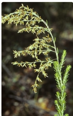
Flowering stem. near Nowra