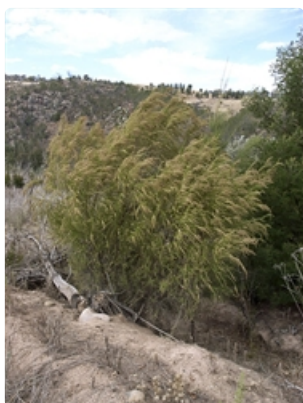
Shrub. Murrumbidgee River, ACT