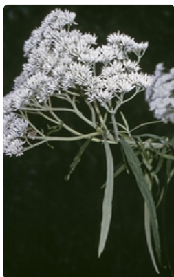
Flowering stem. Moruya State Forest near Moruya