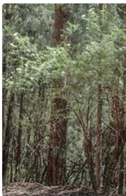
Shrub. between Wauchope and Walcha