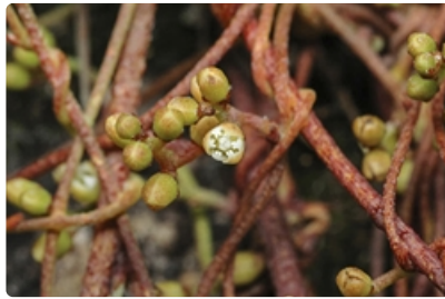
Flowering stems. Australian Plant Image Index, photographer Murray Fagg, Gibraltar Falls, ACT