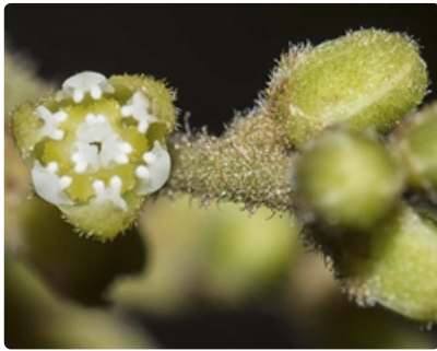
Flower and buds. Photographer Steve Burrows, Bournda National Park