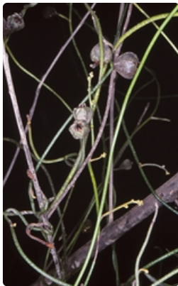
Fruiting stems. NW of Moruya