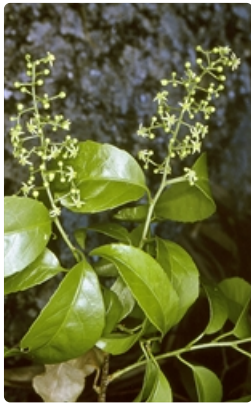
Flowering stems. Bush Heritage Reserve, Brogo