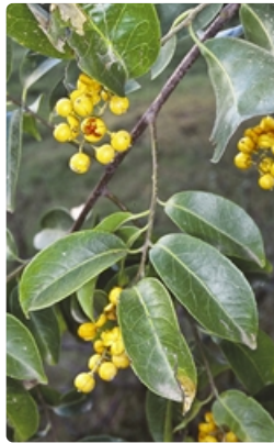
Seed cases and leaves. north of Milton