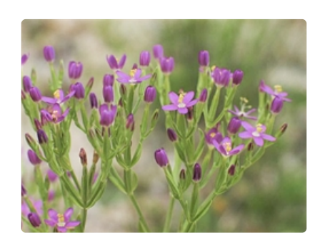
Flow ering stems.