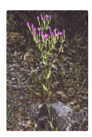
Regional Reserve near Nowra