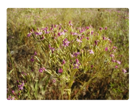
Flowering plant.