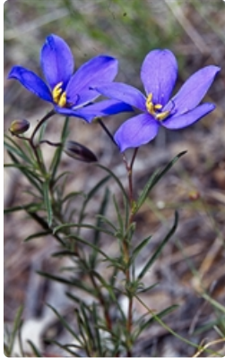
Flowering stems. Photographer Don Wood, Bookham near Yass