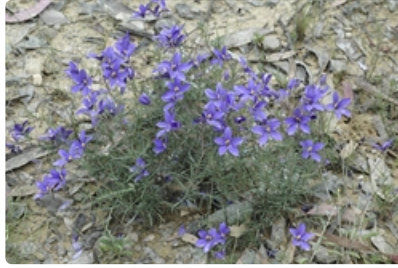
Flowering plant. Australian Plant Image Index, photographer Murray Fagg, Abercrombie Caves