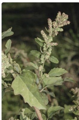
Fruiting stem.