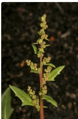
Flowering stem. Australian Plant Image Index, photographer Murray Fagg, Uladulla