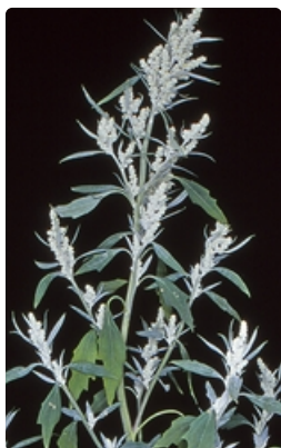
Flowering stems. near Namadgi National Park Visitor Centre, ACT