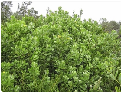
Shrub (subsp. monilifera ). Photographer Hanky Helper, Broulee.