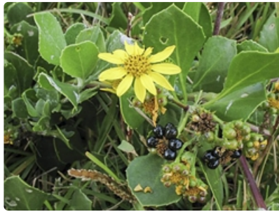
Flower, fruit, and leaves (subsp. rotundata ).