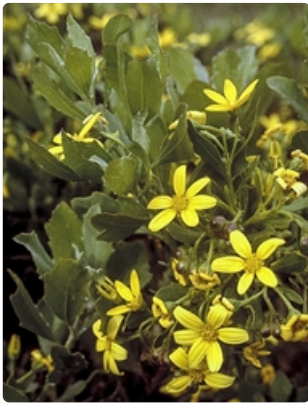
Flowers and leaves (subsp. monilifera ). Australian Plant Image Index, photographer CG Wilson, Flagstaff Hill, SA