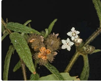
Flowers, seed cases, and leaves.