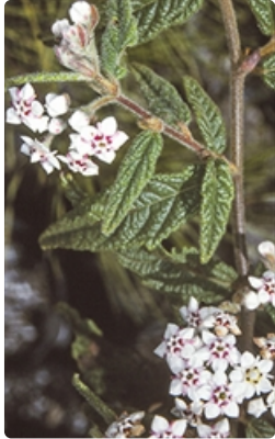
Flowering branches. Photographer Don Wood, Eurobodalla Regional Botanic Gardens north of Mbruya