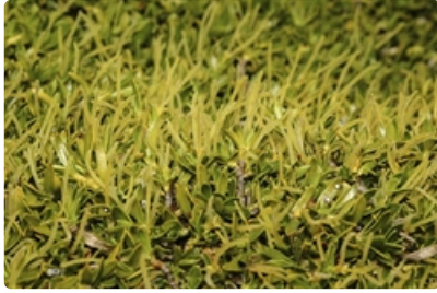
Female flowers and leaves.