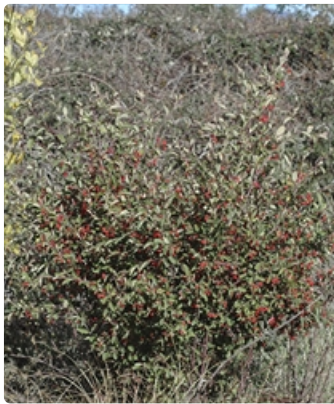
Fruiting shrub.