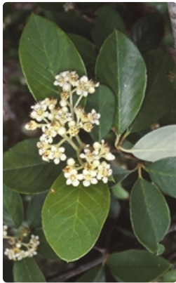
Flowers and leaves. near Bodalla