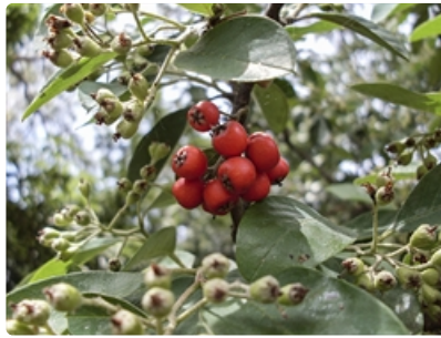
Green and ripe fruit and leaves. near Sydney