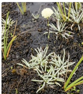
Plants. Photographer Russell Best, Bogong High Plains, Vic