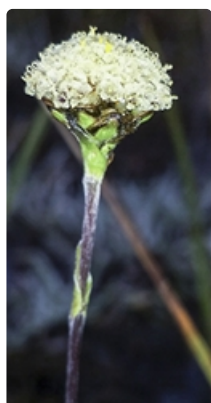
Flower head. Photographer Russell Best, Bogong High Plains, Vic