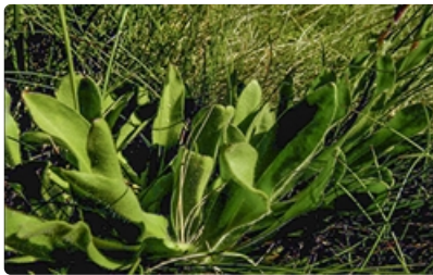
Leaves. unknown place