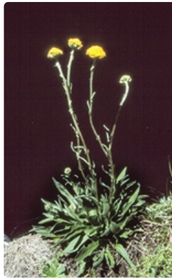
Flowering plants. Namadgi National Park, ACT