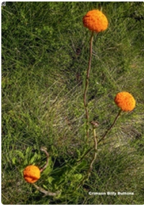
Flowering plant. unknown place