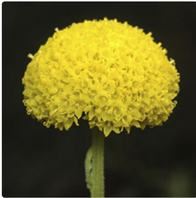
Flower head.