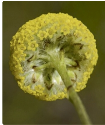
Back of flower head. Nadgigomar Nature Reserve north of Braidwood