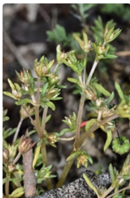
Flowering stems. Brisbane Ranges, Vic