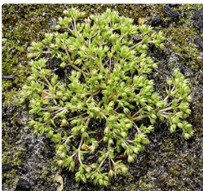
Plant. Brisbane Ranges, Vic