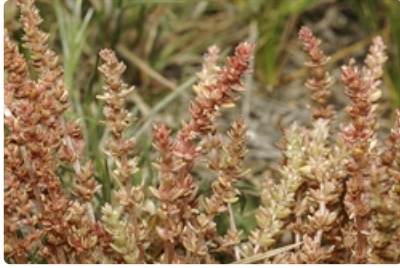
Flowering plants. Scottsdale Bush Heritage Reserve near Bredbo