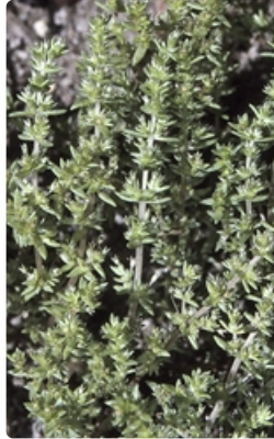
Flowering plants. Bergamui Council Reserve