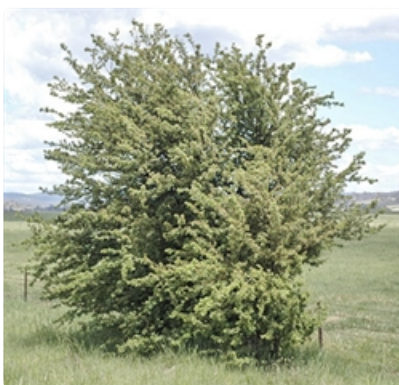
Shrub. Australian Plant Image Index, photographer Murray Fagg, Bungendore to Hoskinstown.