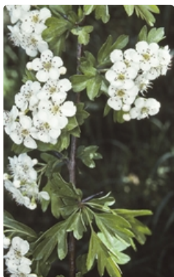
Flowers and leaves. near Candelo