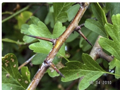
Spiny stem. Fleurieu Peninsula, SA