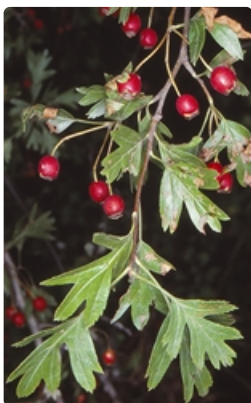
Ripe fruit and leaves. near Bombala