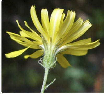
Back of flower head. Photographer Zoya Akulova, California, USA