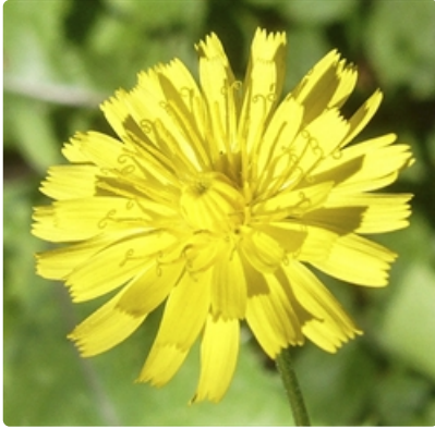
Flower head.