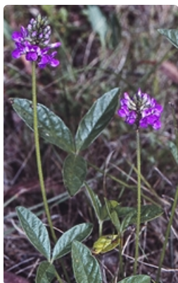
Flowers and leaves. South East Forests National Park