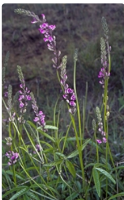
Flowers and leaves. near Glenloch Interchange, Canberra