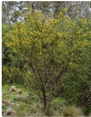
Shrub. Barrington Tops National Park