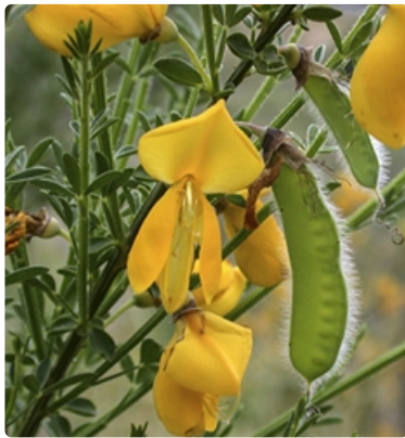
Flowers, pods, and leaves.