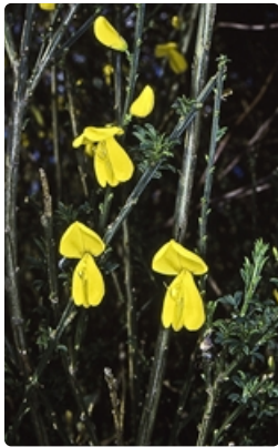
Flowers and leaves. Princes Highway, Terrmell