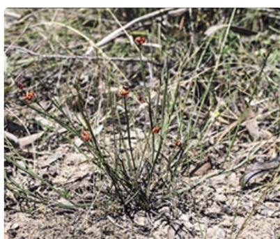
Shrub. Australian Plant Image Index, photographer MD Crisp, Carrington Falls