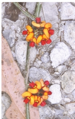
Flowering stems. Hyams Beach, Jervis Bay, NSW