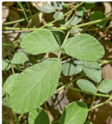
Leaf. Paruna Reserve near Sydney