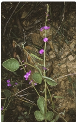
Flowers and leaves. Buckenbowra State Forest west of Batemans Bay