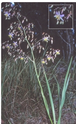
Flowering plant. Photographer Don Wood, Tuross Head