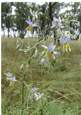
Flowers. Photographer User#122, west of Melbourne