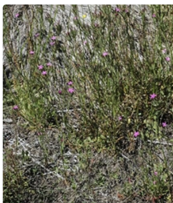
Plants. Australian Plant Image Index, photographer Murray Fagg, Kosciuszko National Park