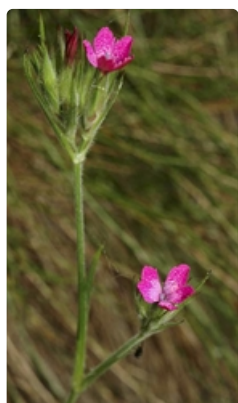
Flowering stems. Kosciuszko National Park