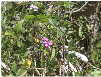
Flowers, pods, and leaves. Photographer Edgar Heim, Lakes Entrance, Vic