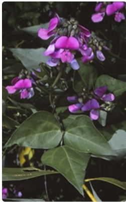
Flowers and leaves. Photographer Don Wood, near Berragui