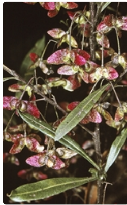
Stems with seed cases. Mmosa Rocks National Park east of Bega