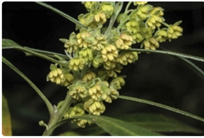
Flowering stems (male).