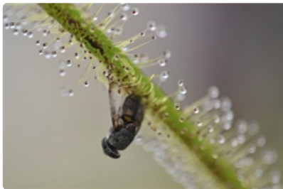
Stem with fly.