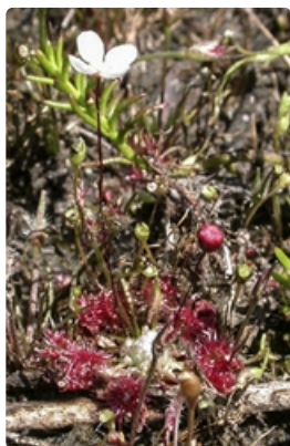
Flowering plant.