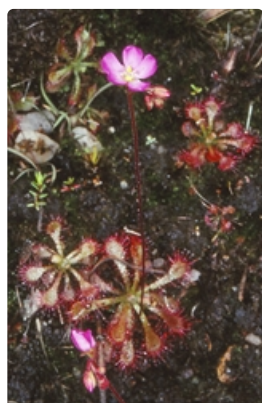
Flowering plants. Bomaderry Creek Regional Reserve near Nowra