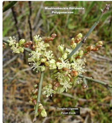
Male flowers.