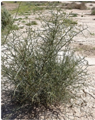
Shrub. Photographer Don Wood, Scotia Sanctuary, western NSW