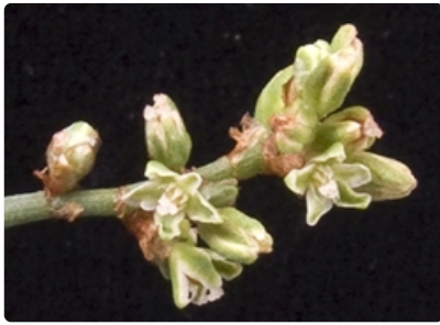
Female flowers. Scotia Sanctuary, western NSW