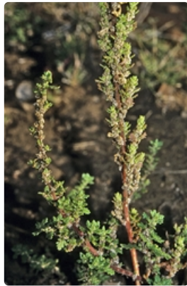
Flowering and seeding stems. Photographer Don Wood, Carnarvon Station Bush Heritage Reserve via Augathella, Qld