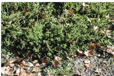
Plant. south of Tharwa, ACT