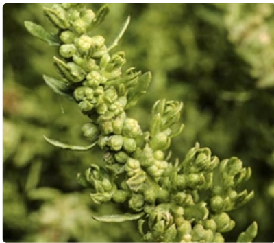
Flowering stem south of Tharwa, ACT