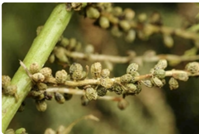
Stems with mature seed cases. south of Tharwa, ACT