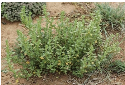
Plant. Scottsdale Bush Heritage Reserve, near Bredbo