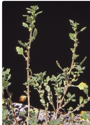
Plant. near Narradgi Visitors Centre near Tharwa, ACT