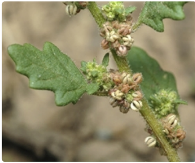
Flowers and leaves. Australian Plant Image Index, photographer Murray Fagg, Cooma NSW