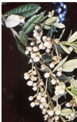
Flowering stems. Photographer Don Wood, Coolangubra State Forest near Bombala