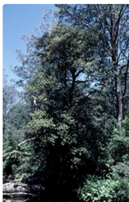
Tree. Australian Plant Image Index, photographer Murray Fagg, near Benboka