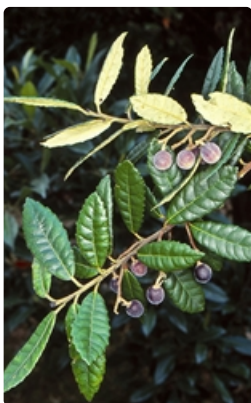
Fruiting stems.