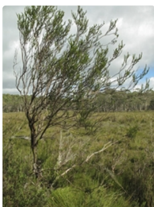
Shrub. Kanangra Boyd National Park