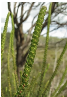
Leafy stems. Kanangra Boyd National Park