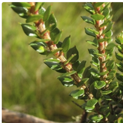
Leafy stems. Kanangra Boyd National Park