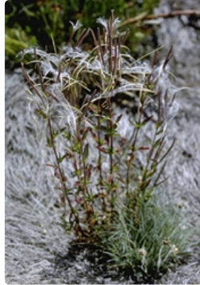
Plant with seed cases Narradgi National Park, ACT