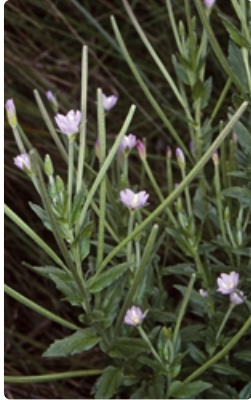
Flowering plant. Monga National Park east of Braidwood