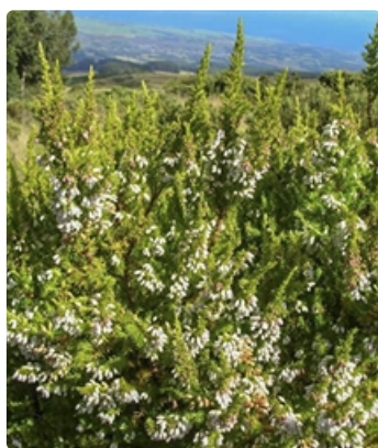
Shrubs.