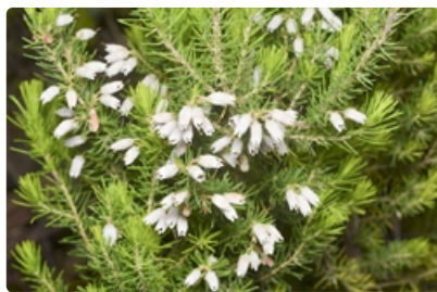
Flowering branches.