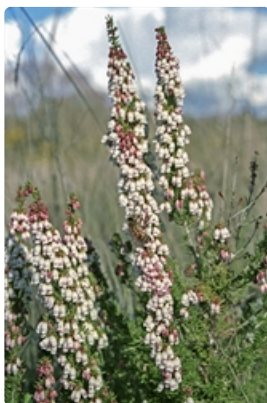
Flowering branches. near Bunninyong, Vic