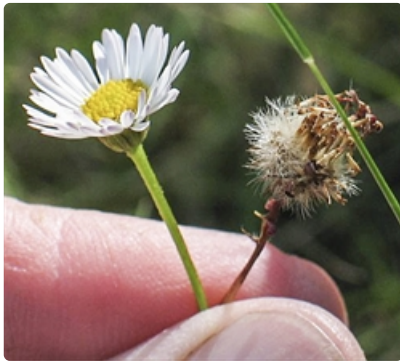
Flower head and seeding flower head.