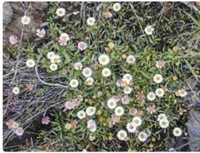
Flowering plants.