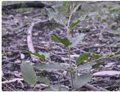
Juvenile leaves.