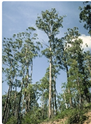
Tree. unknown place