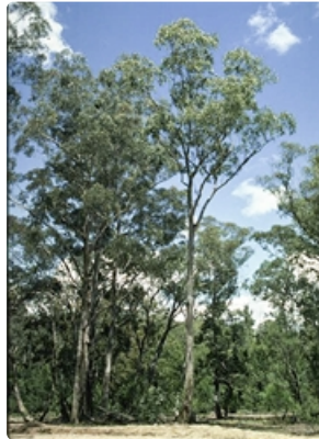
Tree. Australian Plant Image Index, photographers Brooker & Kleinig, unknown place