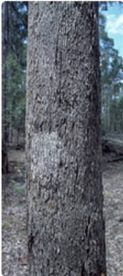
Trunk. unknown place