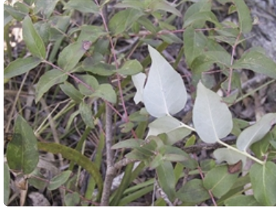
Juvenile growth.