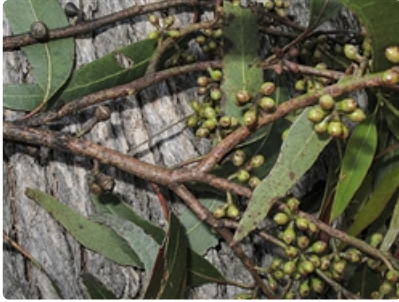
Buds on trunk.