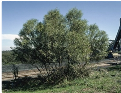
Tree. Australian Plant Image Index, photographers Brooker & Kleinig, unknown place